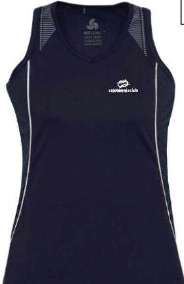
Left: Singlet Top - $18.70 Right: Jacket - $55.00