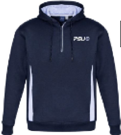
Left: Hoodie - $46.20 Right: Cap - $15.50