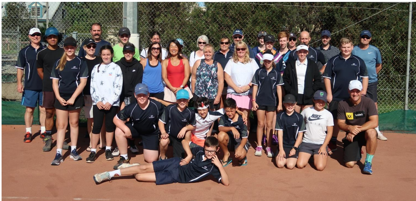
The Sale Dahlsens Challenge Team – They may look happy here but most of them are still stuck in Bairnsdale - they were not allowed back on the bus after losing the Challenge Cup.

Events such as the Dahlsens Challenge are important for the development of junior players in regional areas as they provide a rare opportunity for them to be part of a larger team representing their Club and to compete with and test themselves against their peers from other areas.