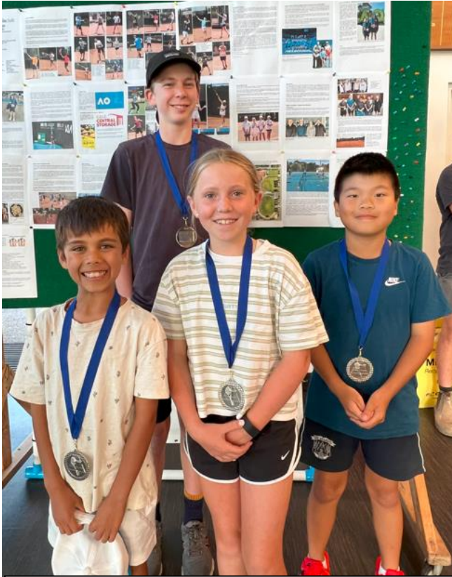
First Season Stars: