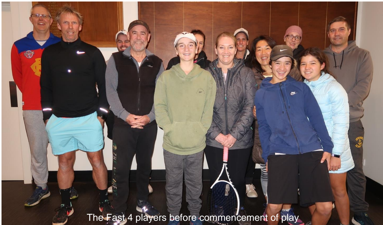
The Fast 4 players before commencement of play

Following the success of this Fast 4 Challenge we will now try to schedule another challenge in Term 4 if COVID allows. Players can be from businesses, families and friends or just put your individual name down and you will be put into a team. Prior tennis experience is not needed. We can cater for all abilities so long as you are prepared to have fun. Families and new players are especially welcome.