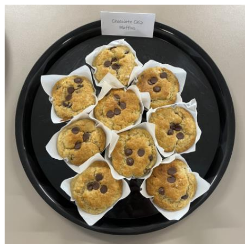
Above: A batch of Lara's famous muffins