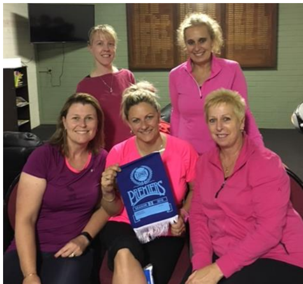
Shot Girls with their pennant

Congratulations to the 5 teams who won their grand finals: Shot Girls, Ball Girls (Monday) and Wallies, sinneT (Wednesday) and Flat Out (Thursday).