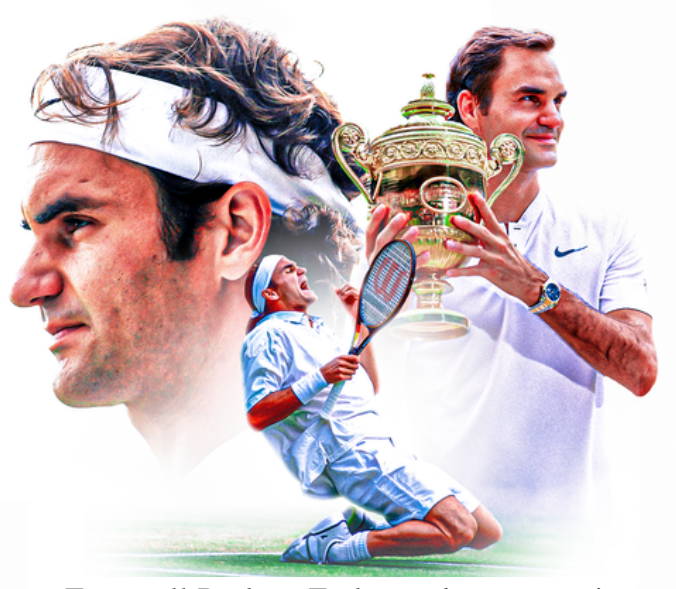
Farewell Rodger Federer, the greatest!

The 6 rear courts are still under renovation in preparation to have them ready for our Open Day on 8 October. We are currently playing on the front 6 courts, however with the amount of rain have seen some waterlogged areas. Hence the importance to wear proper grass shoes!!