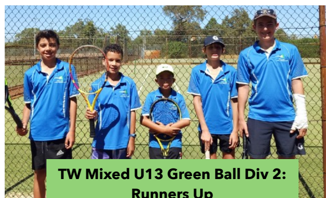
TW Mixed U13 Green Ball Div 2: Runners Up

To conclude the series, the final event at MLTC will be on Sunday, 2 April. Volunteers, Donations & Support in the success of this event is vital. Contact us to show your support