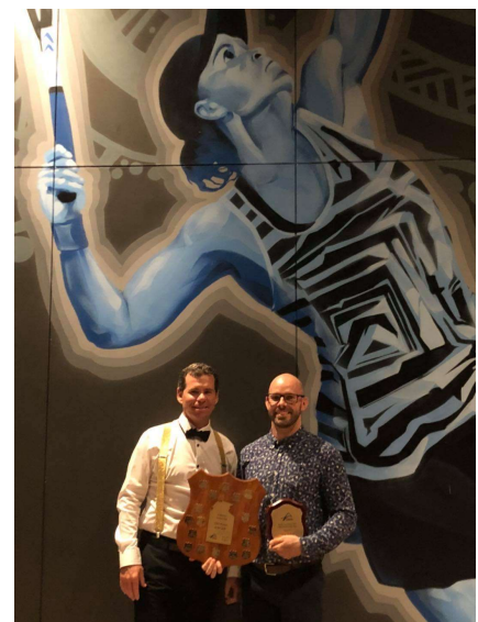
Tennis NT Awards night