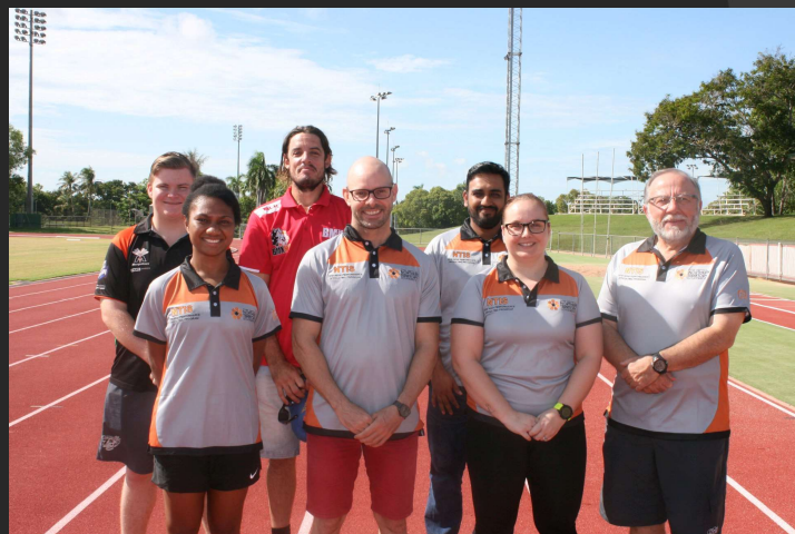
NTIS High Performance Official Program 2020