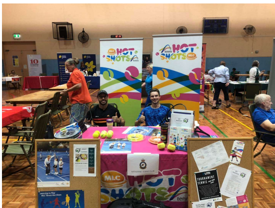
Tindal Expo, Jan 2021