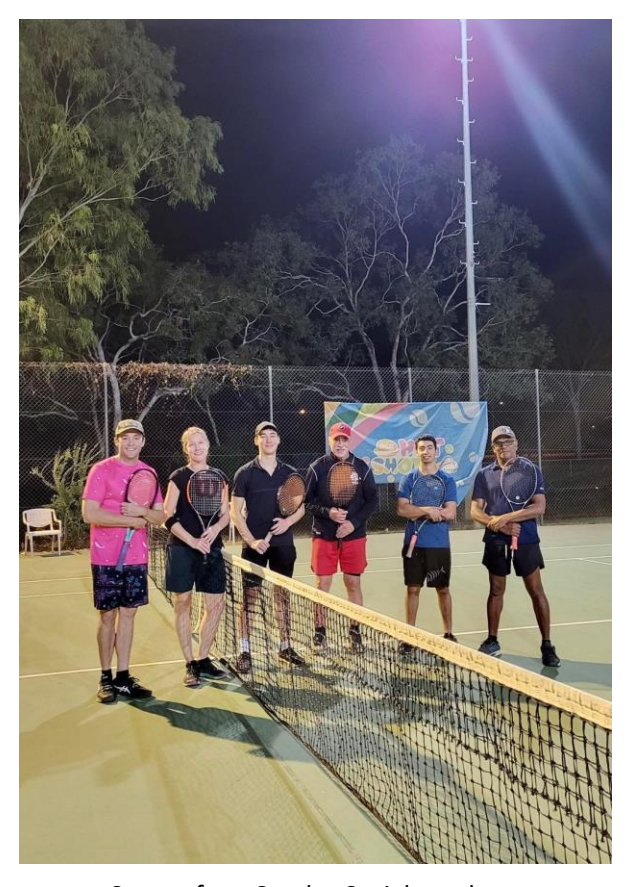
Some of our Sunday Social regulars