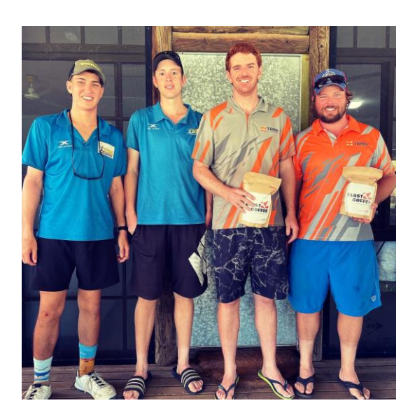
Doubles finalists at the 2022 Katherine Open