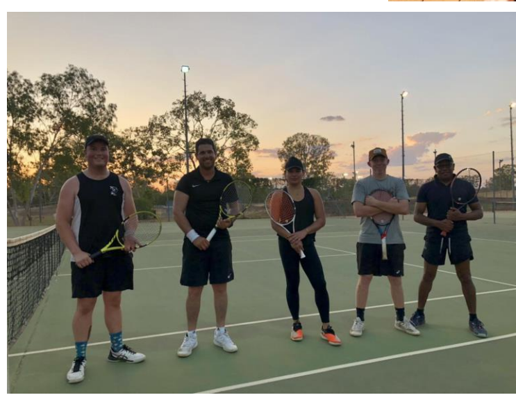
September mini-comp "serious" singles players