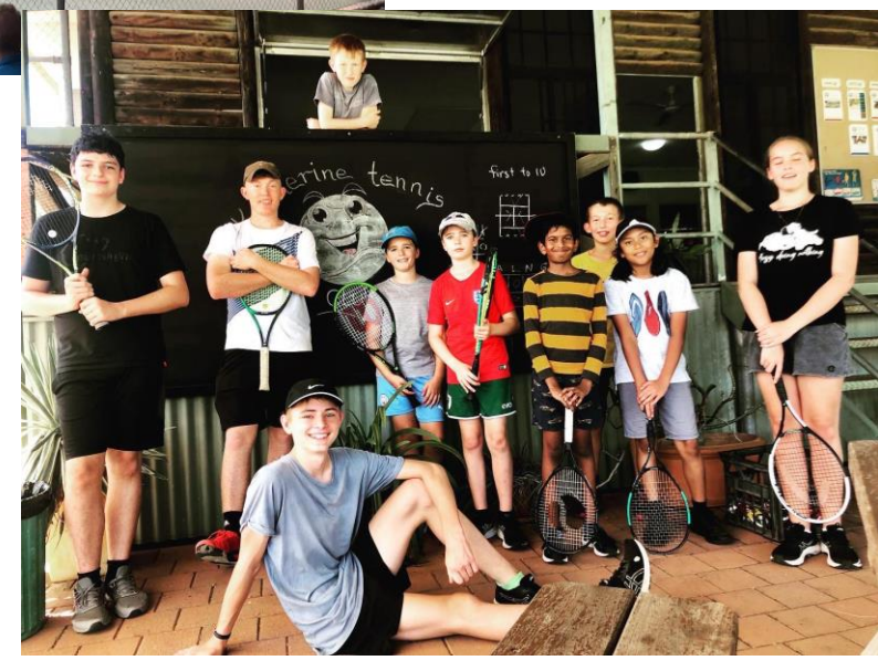
Green Ball group at Saturday Morning Hotshots