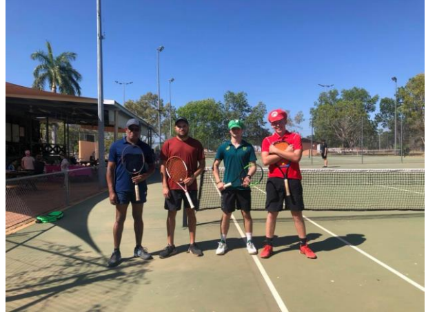
Mario Brothers make an appearance at our mini-comp