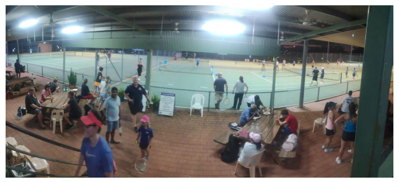
The club super busy during the 2021 Katherine Open