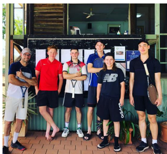
Just a few of the players from our September club mini-comp