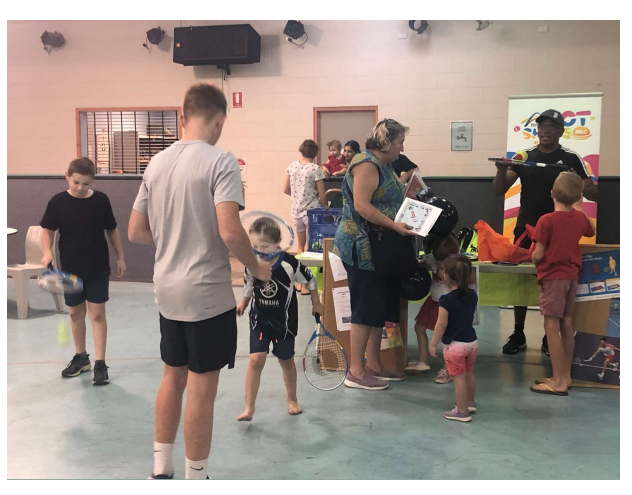
Volunteers promoting the club at YMCA Come'n'try day