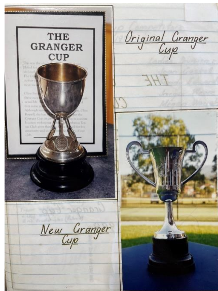
The original trophy and the current trophy

Some Granger Cup statistics, from the period of 1998 to the present, for the general interest of members: