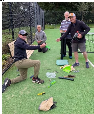
A happy bunch of installers at work.