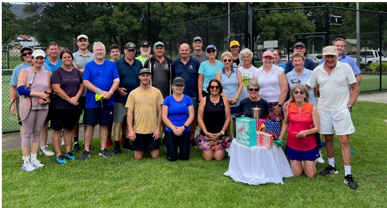
A very happy bunch.

Thank you to everyone that supported this historic Club event.