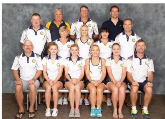
2014-15 GGTC General Management Committee

Position vacant – if you can help please contact secretary@ggtc.org.au .