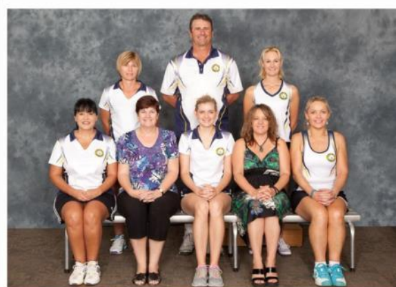
2014-15 Social Committee Members