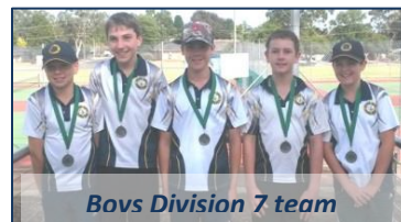
Boys Division 7 team