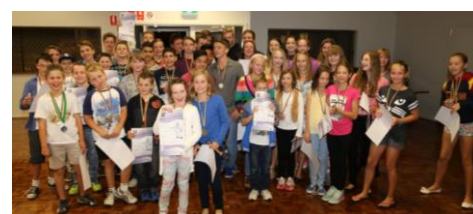
All junior players who attended presentation received a medal and a certificate.