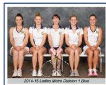
Ladies Metro League Div 1 (Blue)