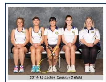
Ladies Div 2 (Gold)