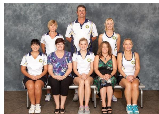
2014-15 Social Committee Members