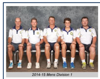
Div 1 Men