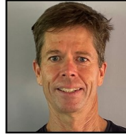
PROPERTY Russell Ward