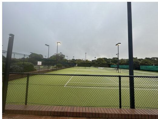
10th June - Water Polo