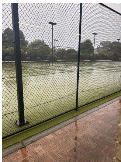
17th June - Synchronised Swimming