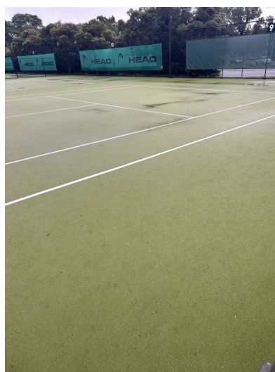
24th June - Snorkling