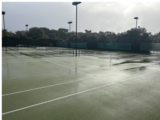
3rd June - Aquarobics