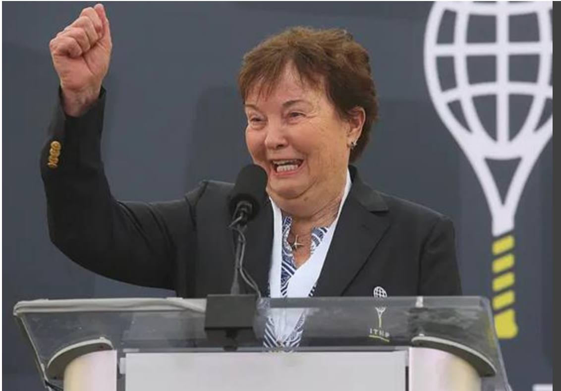
Kerry Melville (Reid) Australian Tennis Hall of Fame - 2014 International Tennis Hall of Fame - 2021