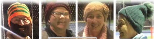
...and the prize for the best beanie for the Bungendore winter tennis comp goes to....