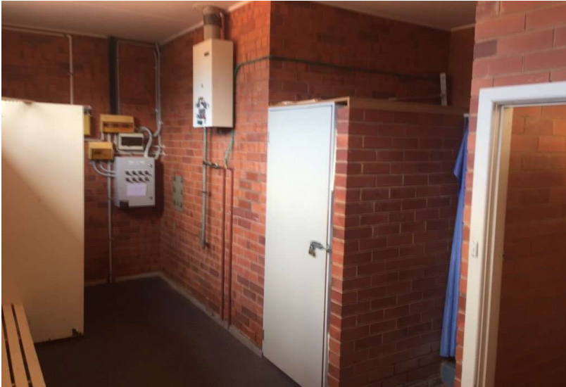
Bathrooms before and after the renovations after the renovation