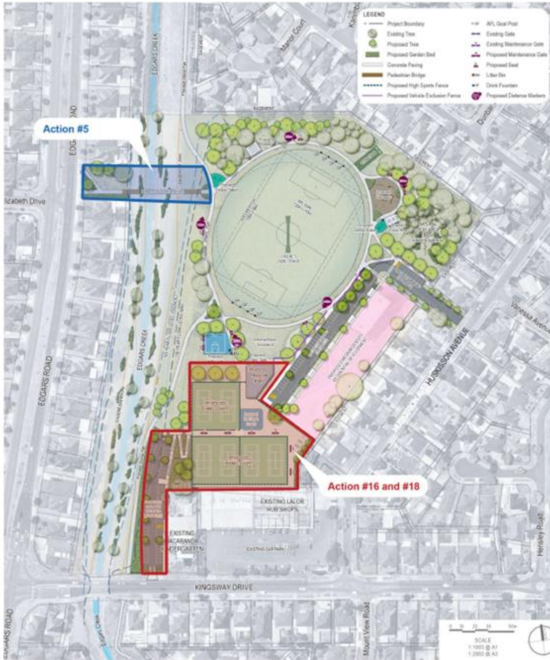
Figure One: Action Site Areas (indicative)