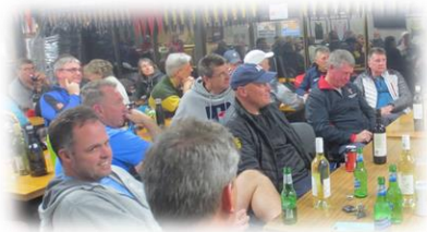
Part of the happy crowd at Winter 2021 Presentations