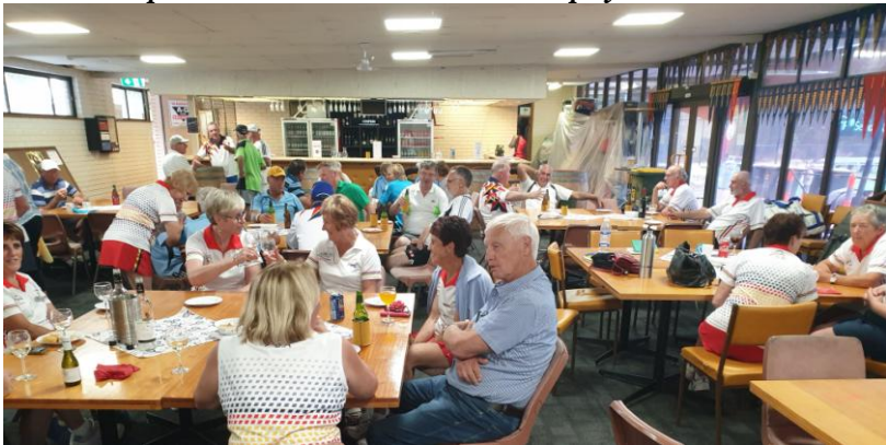
Enjoying afternoon tea after the match