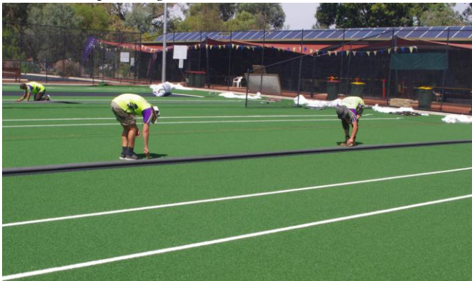
New Surface being laid on Courts 1 & 2