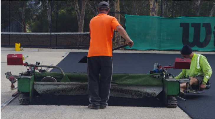
Spreading the new Rubber Shock Pad