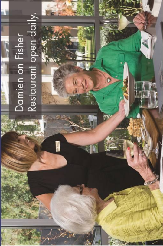
Damien on Fisher Restaurant open daily.

Open daily for viewing between 10am and 4pm. On-site Wellness Centre.