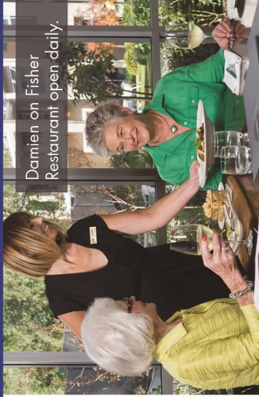
Damien on Fisher Restaurant open daily.

Open daily for viewing between 10am and 4pm. On-site Wellness Centre.