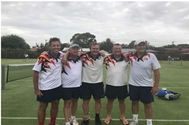
Men's 50-55 Section 1 SA1