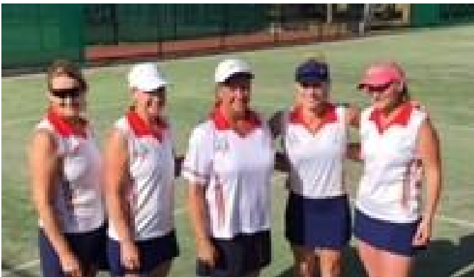
Women's 35/40 SA 1