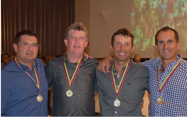
Men's 35-49, SA1