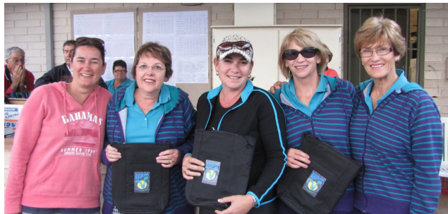
Women's 35-45 Section B Winners - Incredibelles