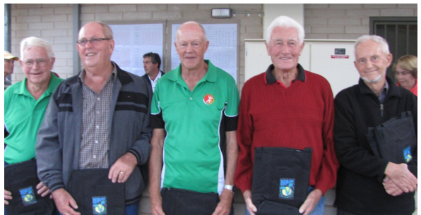
Men's 65+ Section B Winners Woodville/Glengarry