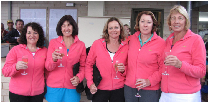
Women's 35-45 Section A Winners – Sets in the City