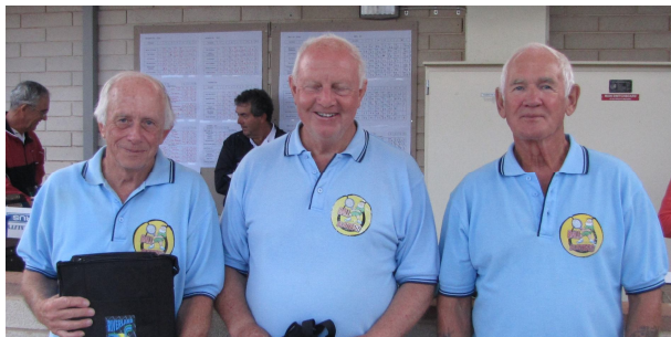
Men's 65+ Section A Winners Ball Busters