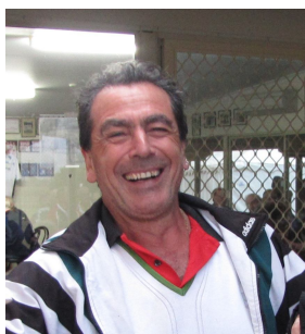
Men's 40+ Div. 2 From Winners Norbelloes