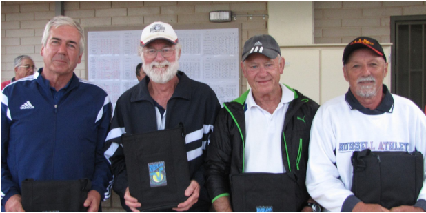
Men's 55+ Winners – Modbury Six Pack