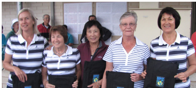
Women's 55+ Div. 2 Winners On The Ball