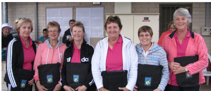
Women's 55+ Div. 1 - Winners Top Tossers