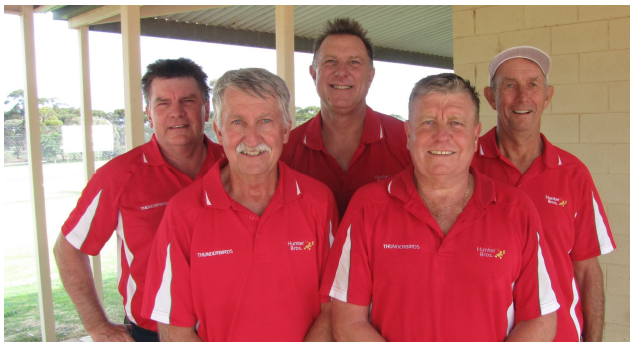
Men's 40+ Division 1 Winners - Thunderbirds