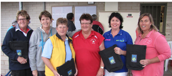
Women's 50+ Section A Winners Southern Portables