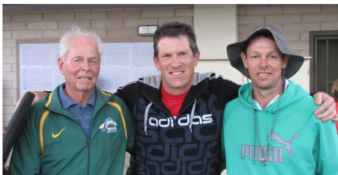
MEN'S 35+ Open Winners – Roosters (Victoria)

IT'S OK, YOU CAN STILL RECEIVE THE RACQUET.