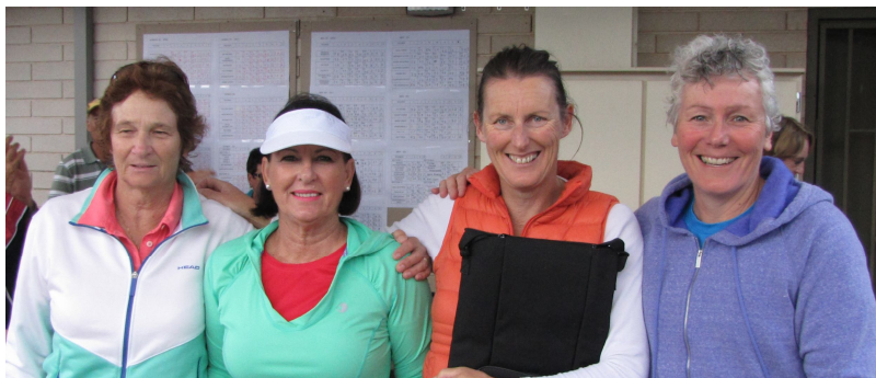
WOMEN'S 35+ Open Winner s – The Ladies (Victoria)