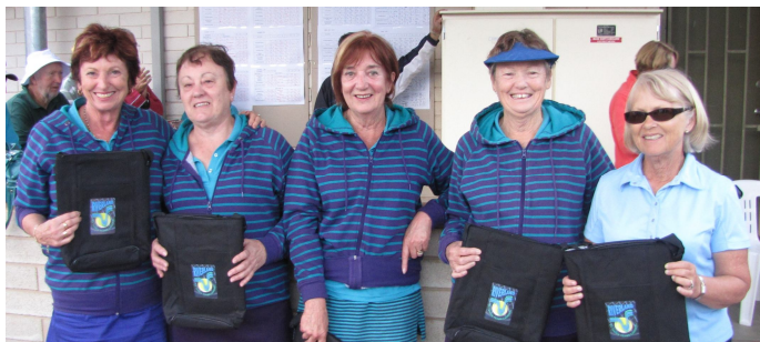
Women's 50+ Section B Winners The Belles