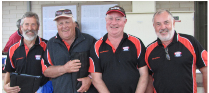
Men's 60+ Winners - Baseliners