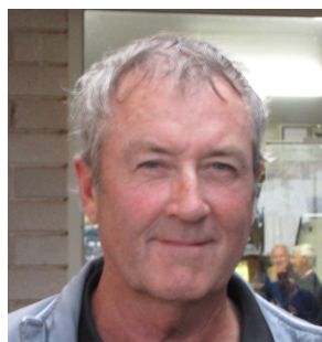
Men's 50+ Section A From Winners Barossa Battlers