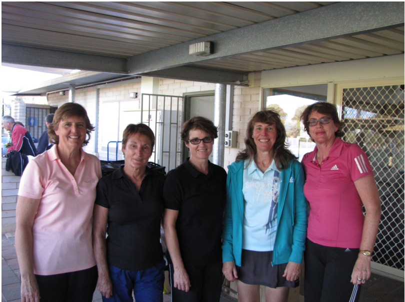
The winning team in Women's 35+ , Berri Good Friends