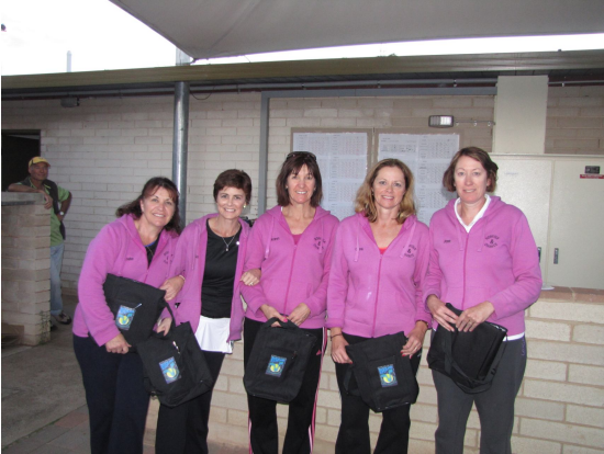
Women's 35-45+ Norfolk and Chance