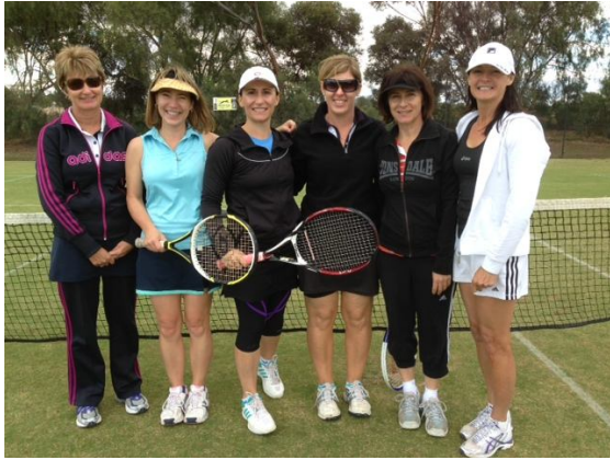
Flaming Sambuccas From the Riverland