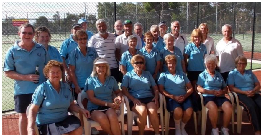
The Northerners relaxing at South Park