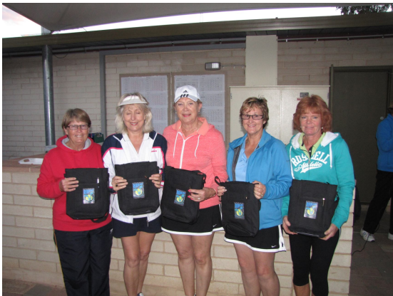
Women's 50-55+ Late Comers