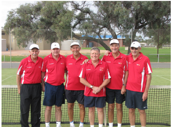
Thunderbirds From Adelaide