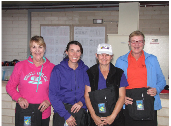
Women's 45-50+ Bangers and Smash 2