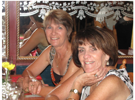
Some of the happy South Aussies at the State Dinner