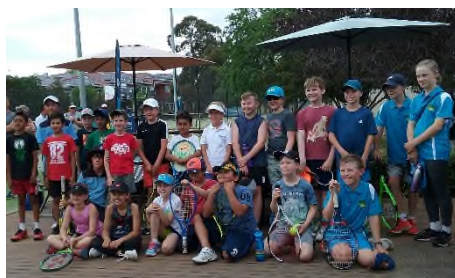
Inaugural Green Ball League participants