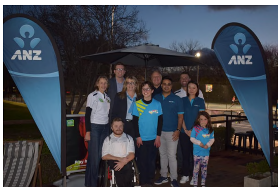
L: Opening of the disabled access facilities and upgraded bathrooms