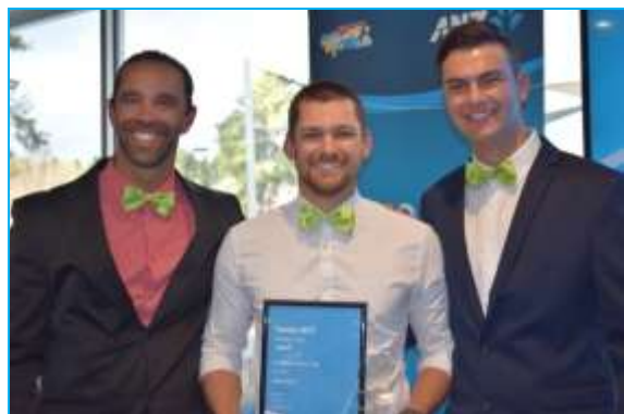
Get Set Tennis coaches