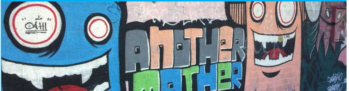
Kaleen clubhouse, graffiti artist unknown.

The KDTC newsletter updates members on club development, on-court and related activities. It is published around Autumn and Spring. Member contributions are welcome.