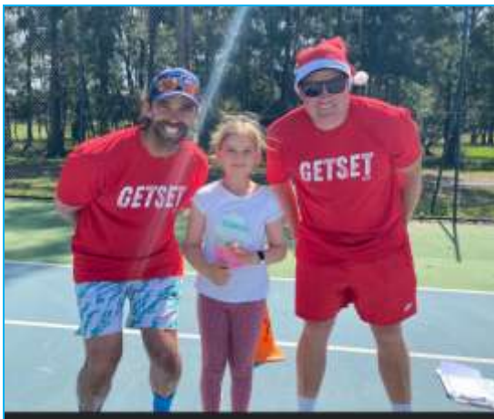
Winners are grinners