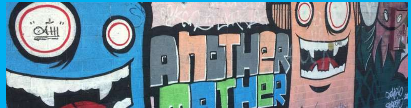
Kaleen clubhouse graffiti. Artist unknown.

The KDTC newsletter updates members on club development and guidelines, on-court and related activities. Member contributions are welcome.