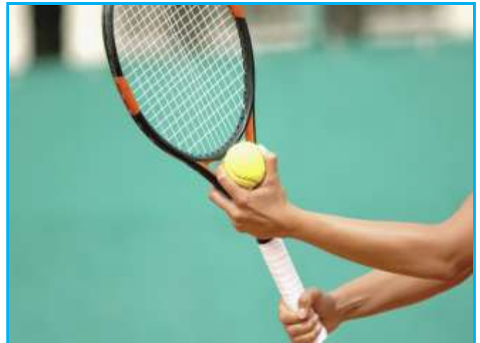
Tennis tops list of sports for increasing life expectancy. - Mayo Clinic Proceedings, Dec 2018