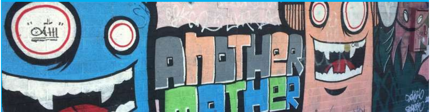
Kaleen clubhouse graffiti. Artist unknown.

The KDTC newsletter updates members on club development, on-court and related activities. Member contributions are welcome.